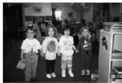
FIGURE 1-2. HEARING AID WEARERS IN THE EDUCATIONAL SETTING.